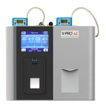
Figure 2: V-PRO s2 Sterilizer with filters