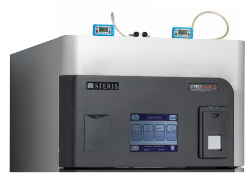
Figure 1: V-PRO maX 2 Sterilizer with filters

In accordance with the OSHA method 1019, a calibrated pump was used to draw air across a coated filter. The measurements were collected at three (3) locations: above the door of the V-PRO maX 2 Sterilizer (Figure 1), above the door of the V-PRO s2 Sterilizer (Figure 2), and in the employee's breathing zone (Figure 3). On each sterilizer, the filters used to collect the samples (for both the PEL and 15-minute exposure) were placed directly above the sterilizer door, flush with the front of the sterilizer.