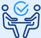
Fiscal year 2025 Associates by segment

At STERIS, we strive to recruit the best available people who are aligned with and embody our core values. We are committed to equality and assessing